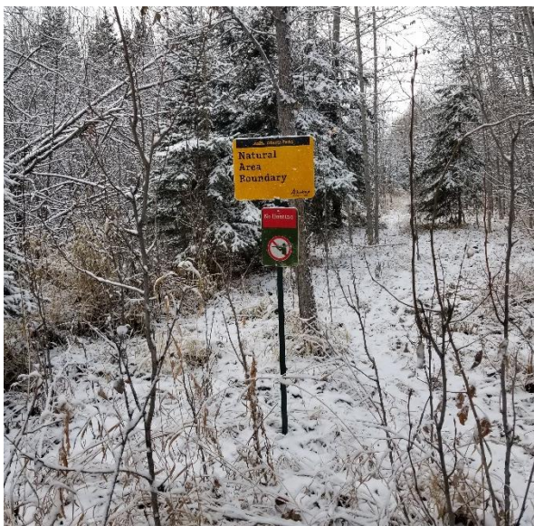
Example of additional signage we installed at locations around Wagner perimeter to deter unauthorized entry. Other signage refers to No Offroad Vehicles at points where access might be attempted. This work is directly in response to concern arising from the Rogue Loggers' incident. Thanks to Parks' staff for extra signs.