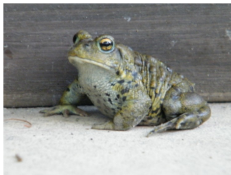
Western or Boreal Toad