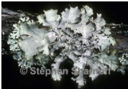
Ragbag lichen, Plasmaticia glauca (Internet photo)