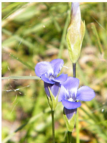
Fringed Gentian in bloom

I learned a lot from the collective expertise of the WNAS members. I accompanied them on many activities; these ranged from science-based outings, such as vegetation surveys, to outreach activities like guided group tours and development of a new trail guide. My summer experience with the Wagner Natural Area Society gave me insight into the trials and triumphs of conservation stewardship, and this will surely help me in future conservation endeavours.