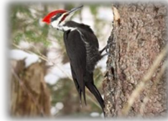
Pileated Woodpecker, Dryocopus pileatus